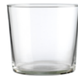
SIDRA MIDI 36CL V1478

12 oz. (US) 12 1 / 2 oz. (IMP) H 89mm · ø 85mm · W 181g 1.485 p.p. (EU. Pallet)