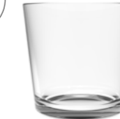
DULCINEA 25 CL V0426 8 1 / 4 oz. (US) 8 3 / 4 oz. (IMP) H 84mm · ø 74,7mm · W 197g 2.156 p.p. (EU. Pallet)