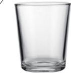
CADAGUA 18CL V4083 6 oz. (US) 6 1 / 4 oz. (IMP) H 87mm · ø 65mm · W 136g 2.904 p.p. (EU. Pallet)