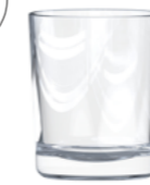
CERERO 16CL V4579 5 1 / 4 oz. (US) 5 1 / 4 oz. (IMP) H 78mm · ø 65mm · W 150g 2.958 p.p. (EU. Pallet)