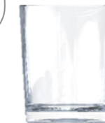
VELADORA 11CL V4251

3 1 / 2 oz. (US) 3 3 / 4 oz. (IMP) H 66mm · ø 57,5mm · W 112g 4.500 p.p. (EU. Pallet)