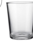
CADAGUA 28CL V1460 9 1 / 4 oz. (US) 9 3 / 4 oz. (IMP) H 89,5mm · ø 79mm · W 222g 1.755 p.p. (EU. Pallet)