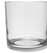
AMBIENT 20CL V1359 6 3 / 4 oz. (US) 7 oz. (IMP) H 85mm · ø 71mm · W 213g 2.232 p.p. (EU. Pallet)