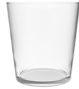
ENVASADOR 45CL V0268

15 1 / 4 oz. (US) 15 3 / 4 oz. (IMP) H 111mm · ø 88,5mm · W 230g 1.350 p.p. (EU. Pallet)