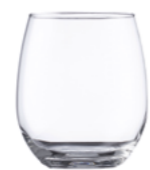
CHABLIS 35CL V1481 11 3 / 4 oz. (US) 12 1 / 4 oz. (IMP) H 99mm · ø 99mm · W 132g 1.540 p.p. (EU. Pallet)