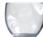
SLEEVE 25CL V1348

8 1 / 4 oz. (US) 8 3 / 4 oz. (IMP) H 70mm · ø 79,5mm · W 120g 2.310 p.p. (EU. Pallet)