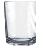
LANGUEDOC 25CL V1889

8 1 / 4 oz. (US) 8 3 / 4 oz. (IMP) H 89,5mm · ø 73,5mm · W 210g 2.558 p.p. (EU. Pallet)