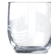
RIGA 29CL V1321

9 3 / 4 oz. (US) 10 oz. (IMP) H 95mm · ø 76mm · W 220g 2.393 p.p. (EU. Pallet)