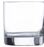
AIALA 30CL V1462 10 oz. (US) 10 1 / 2 oz. (IMP) H 92mm · ø 79mm · W 313g 1.755 p.p. (EU. Pallet)