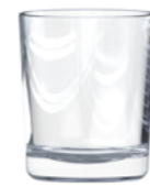
CERERO 20CL V4060 6 3 / 4 oz. (US) 7 oz. (IMP) H 85mm · ø 70,3mm · W 189g 2.304 p.p. (EU. Pallet)